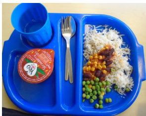
Healthy ,fresh and hot meals everyday!

Many of the worlds their gratitude for plate in different religions show the food on their ways such as Christians saying grace before eating. According to the ethos at Avanti Court the food is first offered to God as a way of thanking. It is believed that this food then becomes spiritualised (called Prashadam) and benefits the recipients' by becoming karma free and also becoming gracious for the precious gift of food and other things provided by nature. Children are also encouraged to be thankful of the snack of fruit at break time and are free to offer to class deities.