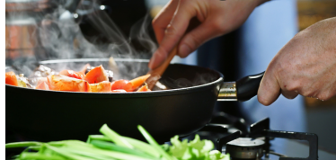
Healthy Eating Clubs