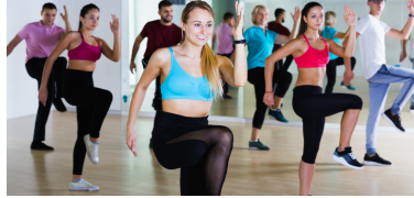
Physical activity classes