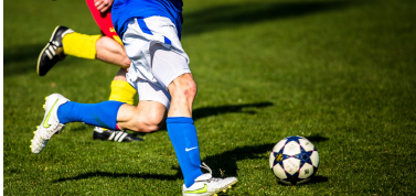
Sport Clubs/ Matches