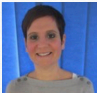
Newly appointed Principal at Avanti Park