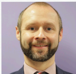
Newly appointed Principal at Avanti Hall

I am very happy to announce that subject to final checks we have appointed permanent principals at both Avanti Hall school and Avanti Park school.