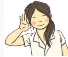
Speaking and Listening