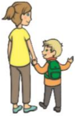
arriving at school