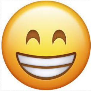
HAPPY AND EXCITED

How are you feeling about coming back to school? Or not coming back?