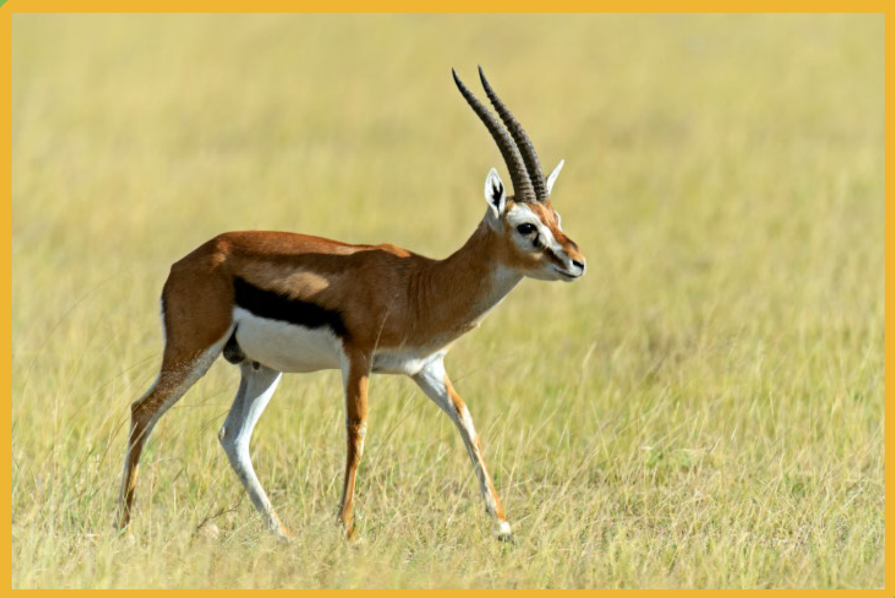
This is a gazelle.