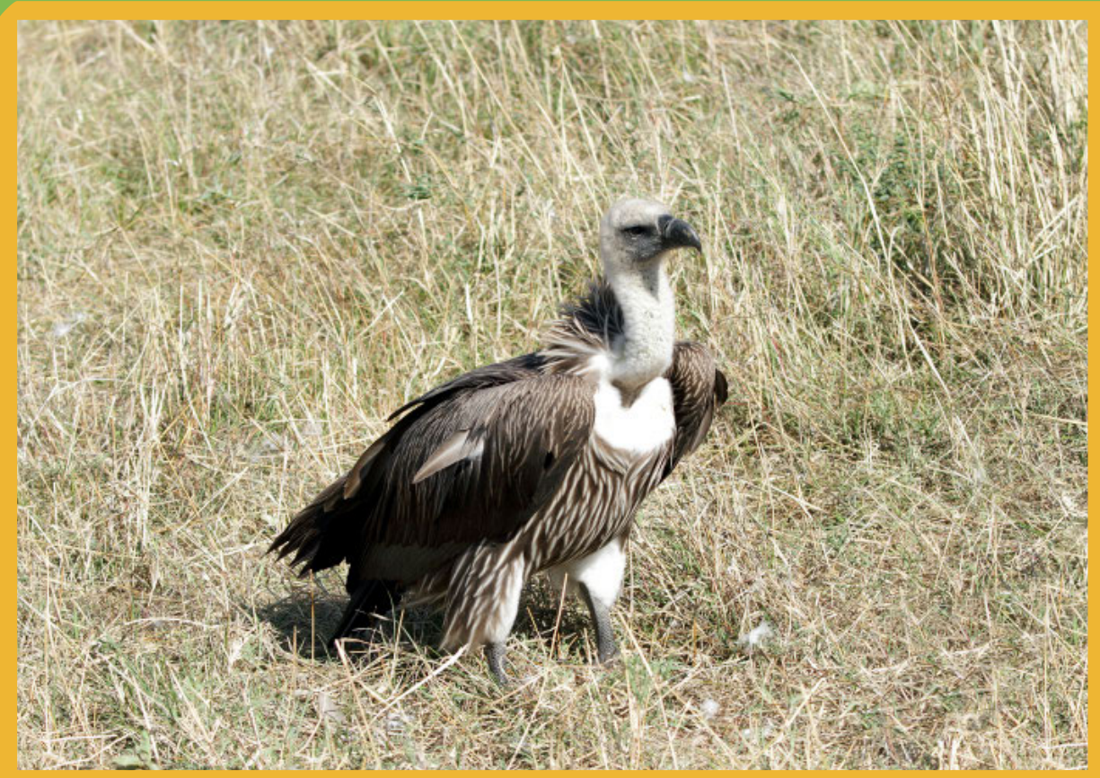
This is a vulture.

Where do you think these animals would like to live? What do they need?