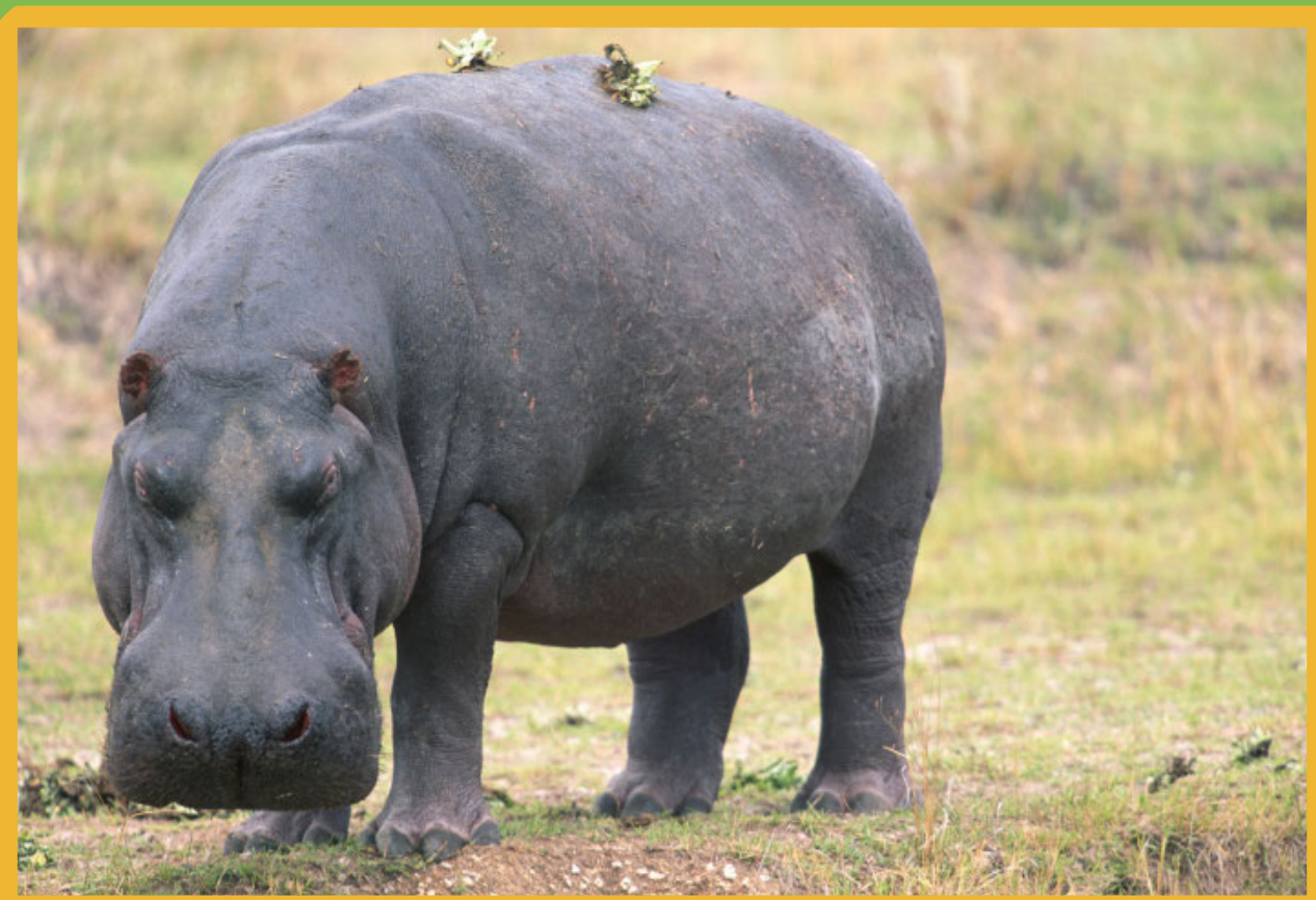
This is a hippo.

Where do you think these animals would like to live? What do they need?