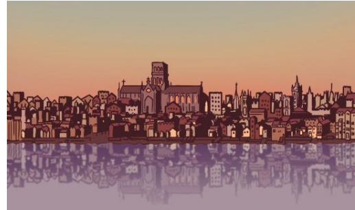
The River Thames in London.

It has destroyed lots of houses and shops.