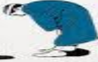
Ruku' (Posture 3)