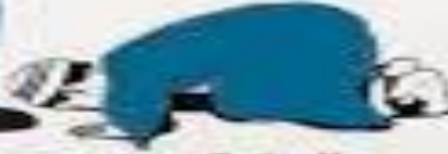
Sajdah (Posture 5)