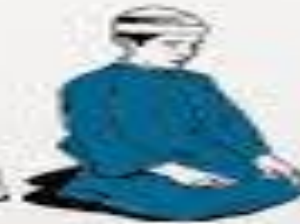
Tashahhud (Posture 6)