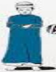
Al-Qiyam (Posture 2)