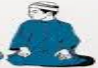
Salam (Posture 7)