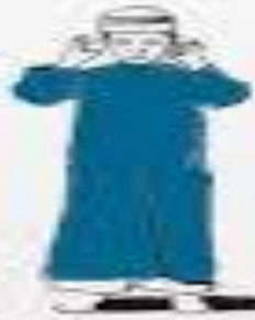
Takbeerat (Posture 1)