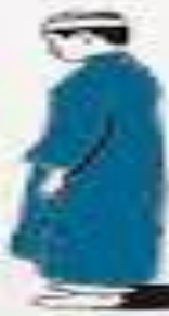
Qiyam (Posture 4)