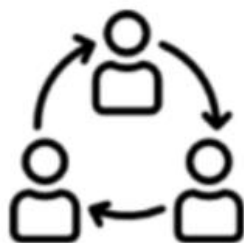
Think Pair Share