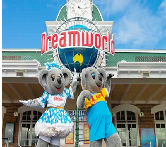
Dreamworld (Amusement park and zoo)