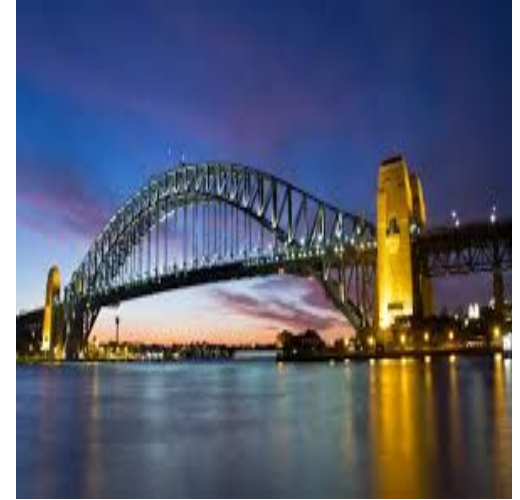
Sydney Harbour Bridge