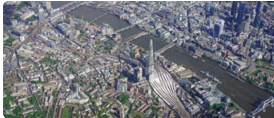
Aerial view of London

A city is a large, busy settlement where lots of people live and work. A city usually has a cathedral, a river, important buildings and offices where people work. There are lots of things to see and do in a city. There are many shops and restaurants to visit.