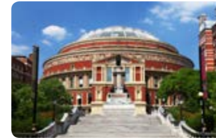
Royal Albert Hall