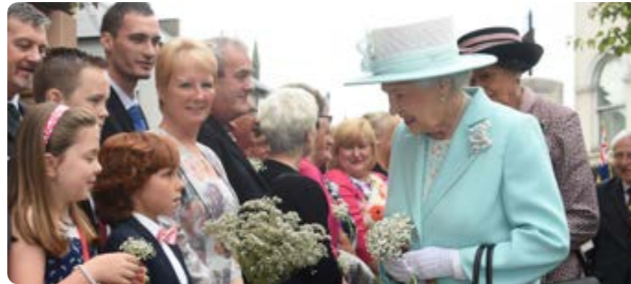
The Queen meets lots of people.

Elizabeth II is the Queen of the United Kingdom. She was born in 1926 and became queen in 1952. The Queen is married to Prince Philip and has a large family. She lives in Buckingham Palace in London. The Queen is very important. She visits charities and schools in the United Kingdom and welcomes world leaders to Buckingham Palace.