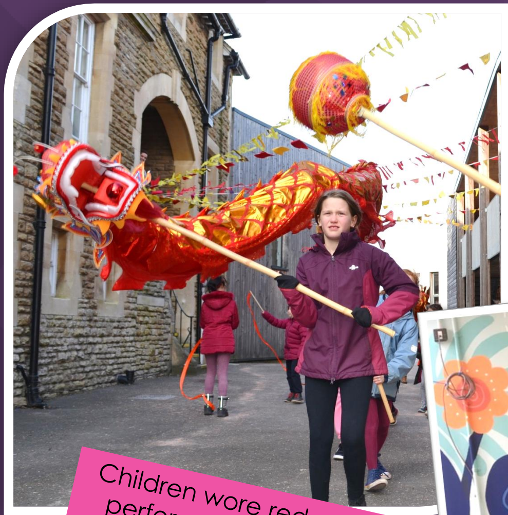
Children wore red and performed a brilliant Dragon dance for Chinese New Year.