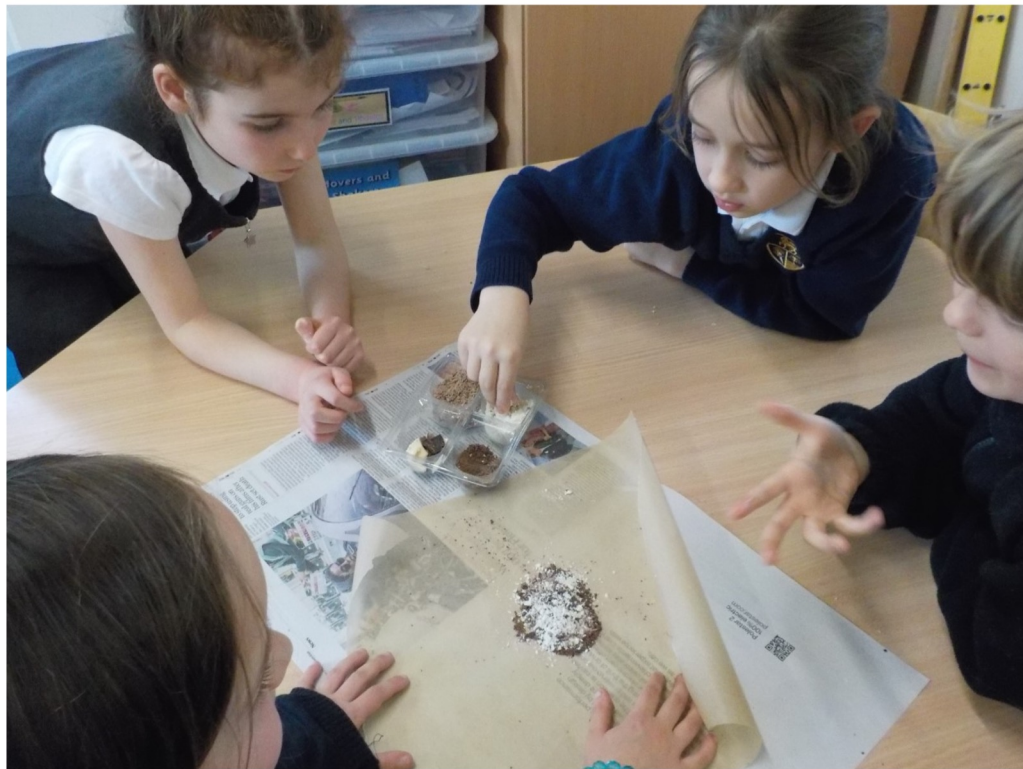
Exploring Science in Cherry Class