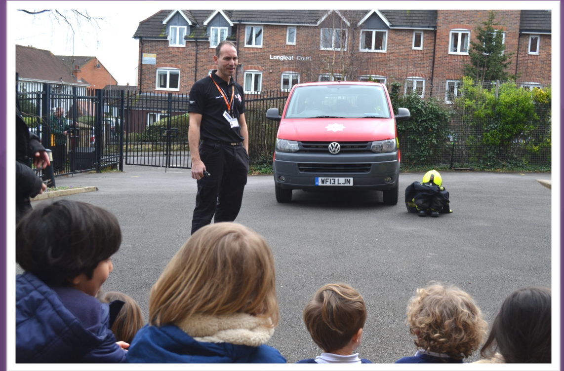
Fire Safety talk