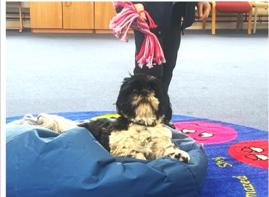
Barney the school therapy dog taking it easy!