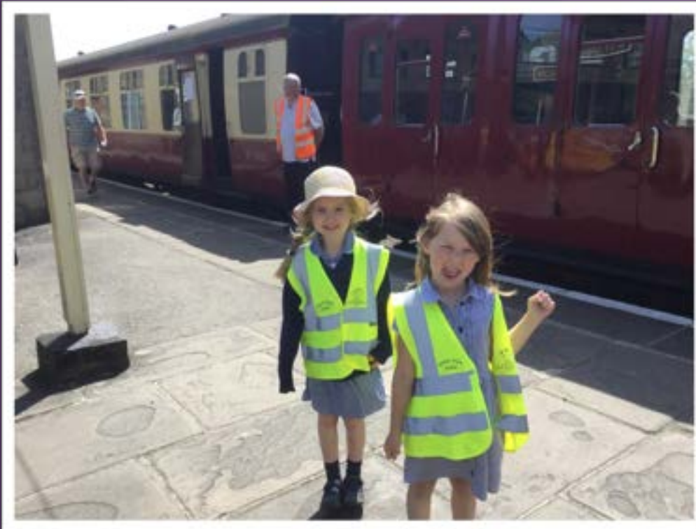
Early Years school trip to East Somerset Railway