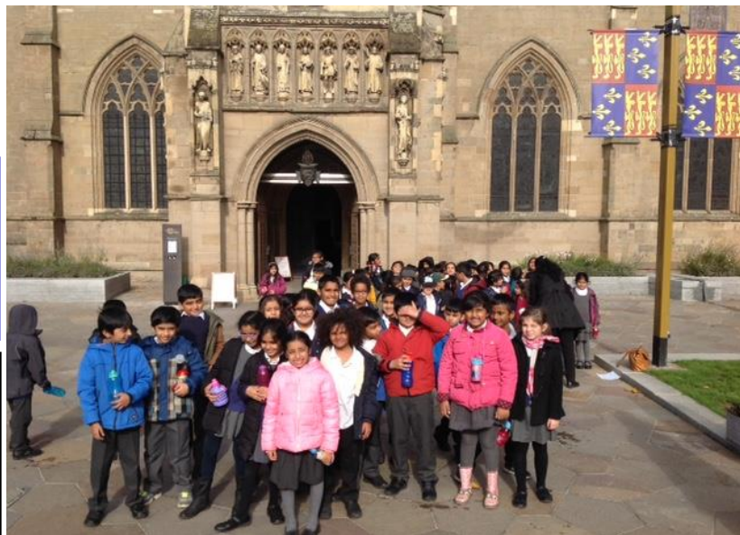
Above: Year 3 children outside the Cathedral in Leicester as part of their visit, on the topic of King Richard 3 rd .

Next week, from Monday 2 nd November, Year 4 children will be taking a selection of poppies and other items for sale round to classes at breaktime. Proceeds are for the Royal British Legion for Remembrance Day.