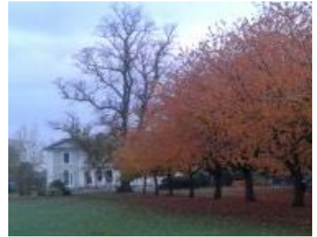
Autumn splendour at Krishna Avanti Primary School