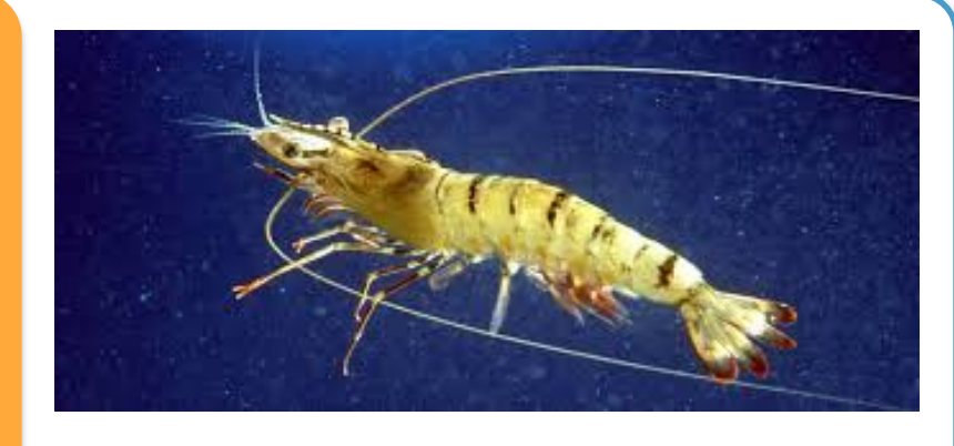
A shrimp's heart is in its head.