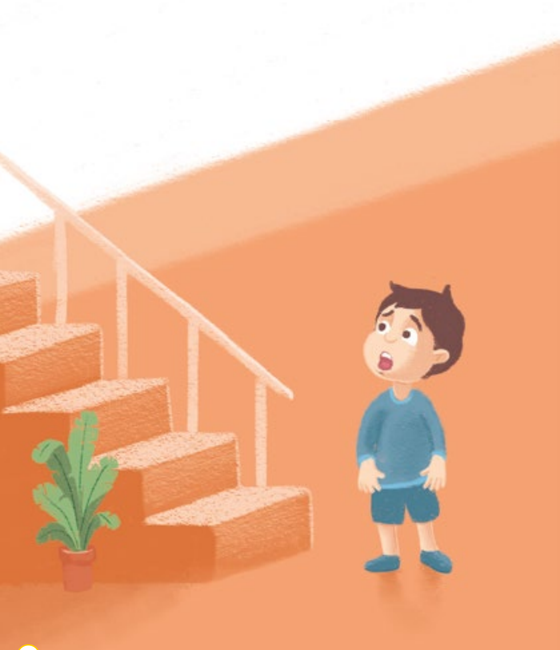
"Is it a big mess?" yells Zack.