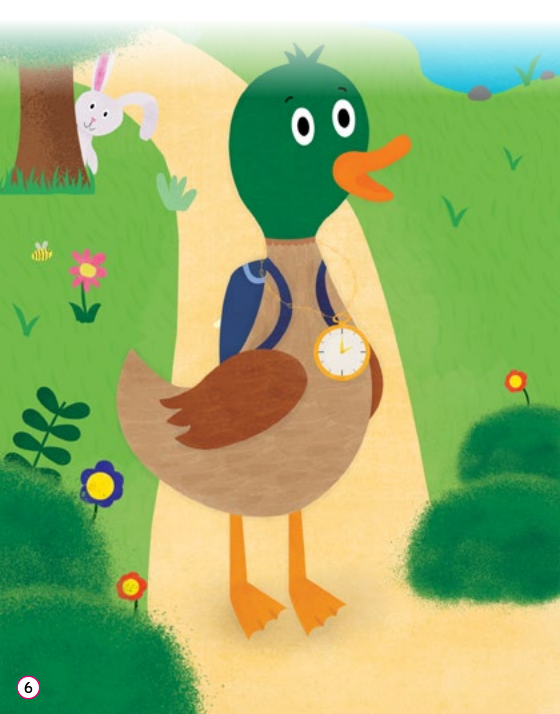
Rick is a duck.