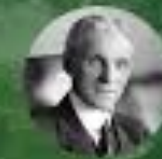
Henry Ford Founder of Ford Motor Company

Failure is simply the opportunity to begin again, this time more intelligently.