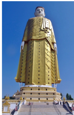
Laykyun Sekkya The Laykyun Sekkya Buddha, Myanmar February 21, 2018

in 1996 building started on the Laykyun Sekkya statue of the Gautama Buddha and was completed in 2008. It is the world's third tallest, standing 116 meters (381 ft). It is located near the city of Monywa in Myanmar.