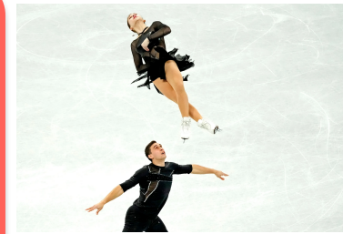
Figure skating is one of the most popular sports at the Winter Olympics. It was first contested at the 1908 London Summer Games and again in 1920 in Antwerp. It became a permanent part of the Winter Olympics in 1924.