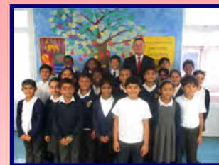
Nominating Ambassadors to lead