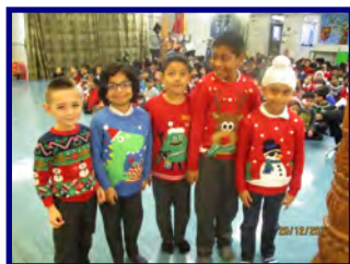
Christmas Dinners and Jumpers 2017!