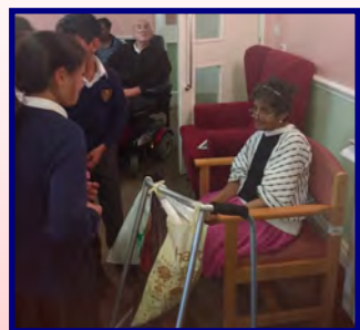
Raising a smile at Springfield Care Home