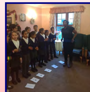
Music creating togetherness