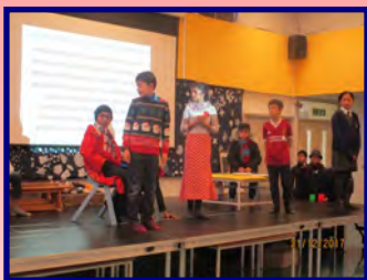
Writing and performing play scripts