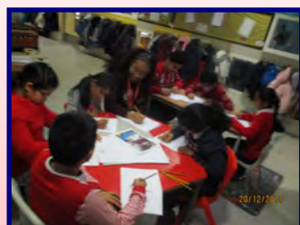
Working with an artist on Cubism