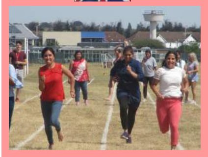
Even our parents joined in!