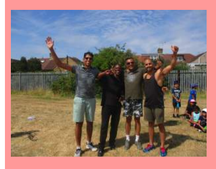
Winning the running race for the Dads!