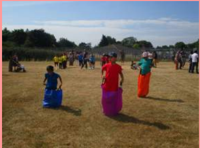
Courage, Resilience and Respect