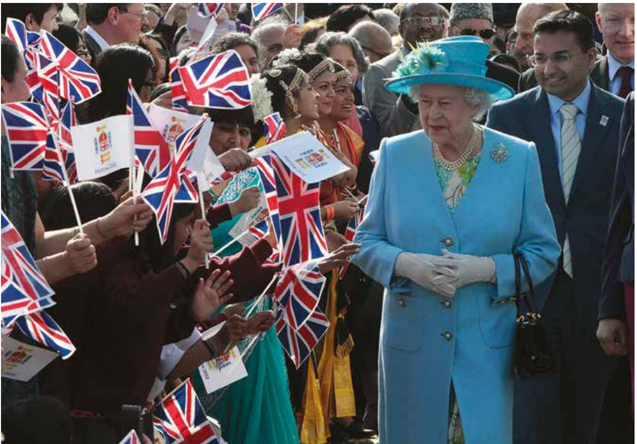
Her Majesty the Queen

Pupils from Avanti have performed at venues as diverse as 10 Downing Street to Wembley Stadium for PM Narendra Modi and PM David Cameron, and the Royal Festival Hall.