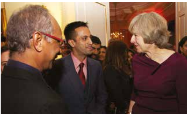
Prime Minister Theresa May at Downing Street