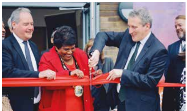
Damian Hinds, Secretary of State