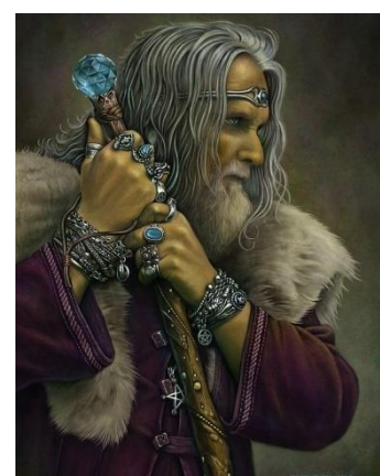
Edgetheow, Beowulf's father