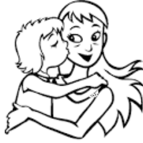
माता mātā (Mother)