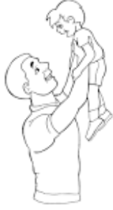
पिता pitā (Father)

(This is to consolidate in-class learning and does not have to be returned or uploaded back to the school.) (Please keep at home for reference.)