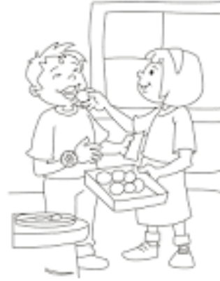
भगिनी bhaginī (Sister)