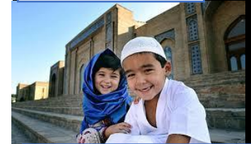
Head scarf/ prayer cap