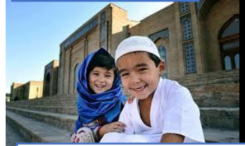
Head scarf/ prayer cap