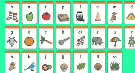
My Phase 2 Sound Mat