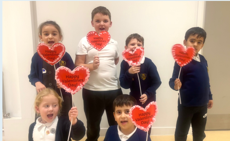
On Wednesday afternoon, we celebrated Valentines Day and made something special for our loved ones!