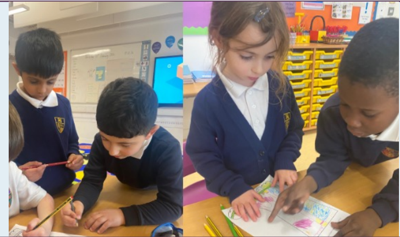
In PSHE, children worked in teams to design a collaborative piece of work. They negotiated, listened and made suggestions. They appreciated each other's opinions and recognised how difference is to be celebrated.