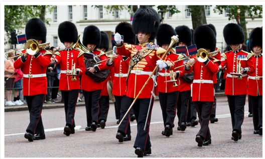
military marching band

A marching band is a group of musicians who perform their music while they are marching. They usually play brass, woodwind and percussion instruments. The musicians often wear a uniform and perform in parades or at special events. They usually march in lines and are led by a conductor. They work together to keep in time and follow the beat of the music.