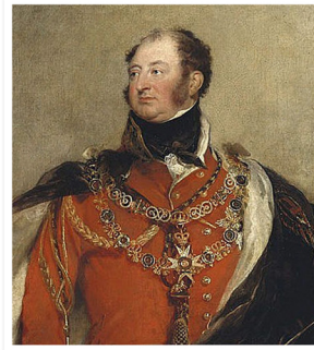
Portrait of Prince Frederick

The Grand Old Duke of York is thought to be about Prince Frederick, Duke of York and Albany, who was the second son of King George III. In 1794, Frederick was asked to lead a huge army against the French. Frederick was not a good leader, and he lost the battle. Frederick decided to learn how to be a better leader. He worked hard, and his army went on to win many battles.