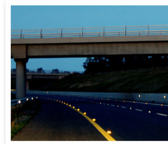
Cat's eyes are light reflectors