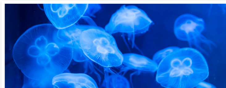
Jellyfish displaying bioluminescence

Some marine animals have chemicals in their cells that make light or bacteria that live on them and produce light. This is called bioluminescence. Bioluminescence can be used as defence, camouflage, to attract prey or to see in the dark. The most common colours of bioluminescence are blue, green and red.