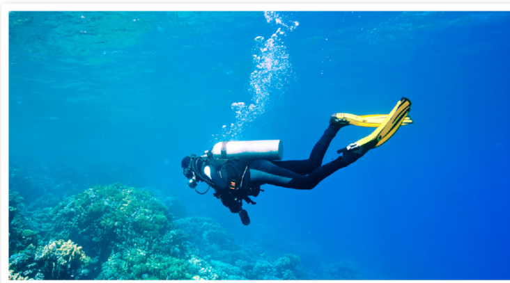
Deep sea diver using an aqua-lung to breathe

Ocean diving can be dated back to 4500 BC when people in the coastal areas of Greece and China dived for food. Cousteau's invention of the aqua-lung meant divers could take air with them, spending more time under the water and going deeper than ever before. Cousteau used the aqua-lung to explore and film the underwater world more freely.