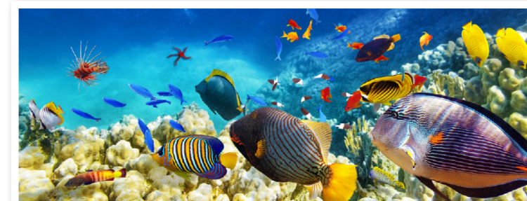
Tropical fish in a coral reef

Corals are marine invertebrates that live in large groups called colonies. Some species produce a hard exoskeleton that forms into a coral reef. The Great Barrier Reef, on the north-eastern coast of Australia, is the longest and largest coral reef in the world, with over 600 types of coral. Corals are at risk of being destroyed by climate change, pollution and consumers.