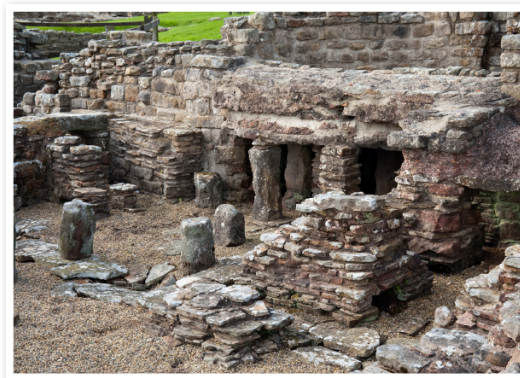
Ruins at Vindolanda Roman fort in England

The Romans invented or developed many things that are still used today. They designed a system of underfloor heating to keep homes warm. They developed a drainage and sewerage system. The Romans built many roads, some routes that are still used today. They also built stone forts and walls for defence, such as Hadrian's Wall and the fort at Vindolanda. Roman baths and aqueducts made of stone are still standing. The Romans brought in coins called denarii to buy things. The calendar we use today is based on the Roman calendar, with July and August being named after Julius Caesar and Emperor Augustus.