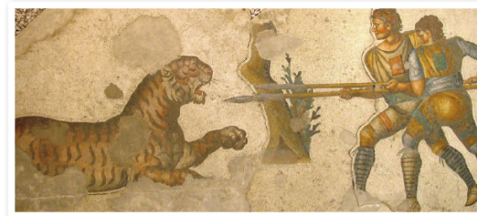
Roman mosaic showing gladiators fighting a tiger

Gladiators in ancient Rome were often slaves, criminals or prisoners of war. They were trained to fight each other or wild animals for the entertainment of huge crowds. They fought in large, open-air arenas called amphitheatres. Gladiators' lives were tough. They lived in special training schools called ludi . The schools were more like prisons, and the gladiators had very little freedom. Once in the arena, they would often fight to their deaths.