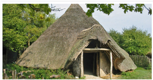
Recreation of a Celtic roundhouse in Dorset

The Celts were tribespeople who lived in England and across most of Europe over 2000 years ago. In Britain, there were many tribes of Celts, each with its own king. They were often at war with other nearby tribes. Celts lived by farming, hunting and gathering. They built roundhouses made from wattle and daub with thatched roofs. Most Celts farmed the land and kept animals, but there were also skilled craftsmen and blacksmiths. They made jewellery using glass beads and pots from clay.