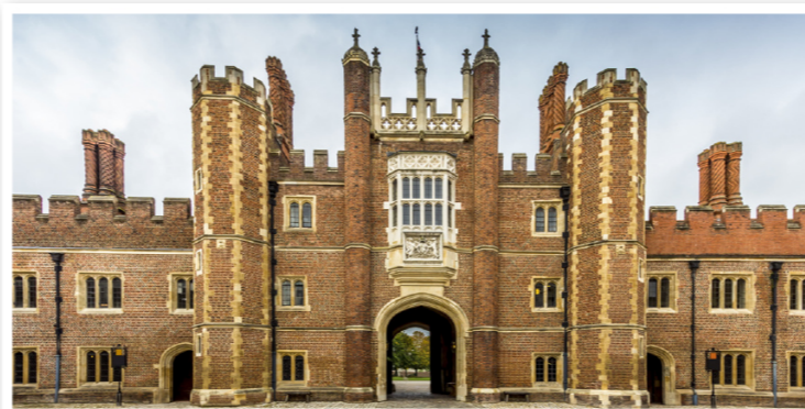
Hampton Court Palace

Henry VIII had over 60 homes and his favourite was Hampton Court Palace. Henry enjoyed showing off his wealth at court. It became a centre for his favourite things, including art, music, dance, poetry and tournaments. The richest and most important people in the country also lived at court. To show their wealth and impress the king, the courtiers wore expensive clothes made of silk, velvet and lace. They had to please the king, give him expensive gifts and flatter him. If they displeased him, they would be severely punished or even executed.