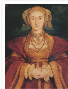
Anne of Cleves by Hans Holbein

Holbein was a German artist and portrait painter. He travelled to England in 1532 with the backing of Anne Boleyn and Thomas Cromwell. In 1535, he became the King's Painter. Holbein painted many portraits of the royal family and the nobles. He was also asked to paint a picture of Anne of Cleves so Henry could decide if he wanted to marry her. Henry liked the portrait but the marriage only lasted six months because Anne didn't look as beautiful in real life as she did in her portrait.