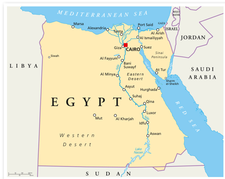
A map of Egypt

Egypt is in the north-east corner of Africa and is well-known for its ancient history and culture. Much of Egypt is covered in desert and there is very little rain. The Nile is the main river that flows through Egypt.