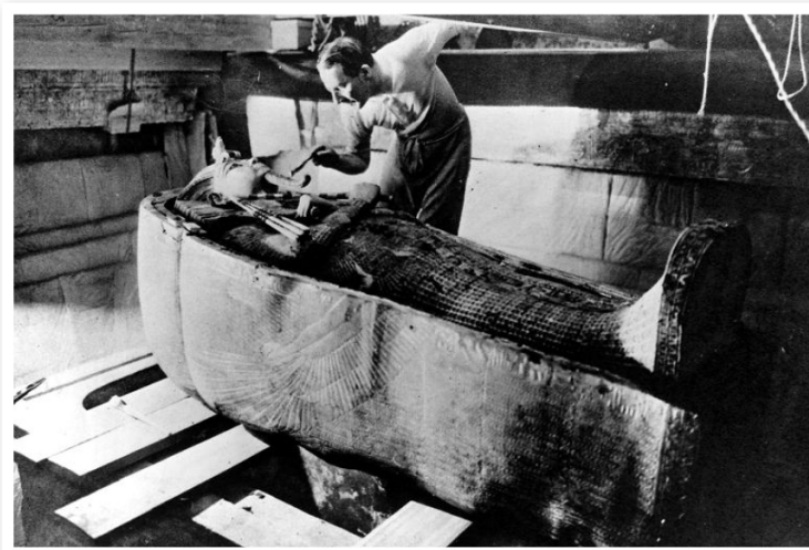
Howard Carter examining the tomb of Tutankhamun

A wealthy Englishman, Lord Carnarvon, was interested in ancient Egypt. He paid for an archaeologist called Howard Carter and a team of workers to carry out excavations in the Valley of the Kings on the west bank of the Nile, where they discovered Tutankhamun's tomb. It took Carter and his team 10 years to remove over 3000 items from the tomb. After the discovery, a series of strange events occurred, including the death of Lord Carnarvon. Many people believed a curse had been placed on Carter's team for disturbing the tomb.