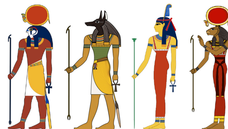
Ra Anubis Ma'at Tefnut

Tefnut was the goddess of moisture and the mother of the sky and the Earth. She had the head of a lioness.