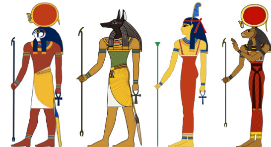
Ra Anubis Ma'at Tefnut

Tefnut was the goddess of moisture and the mother of the sky and the Earth. She had the head of a lioness.