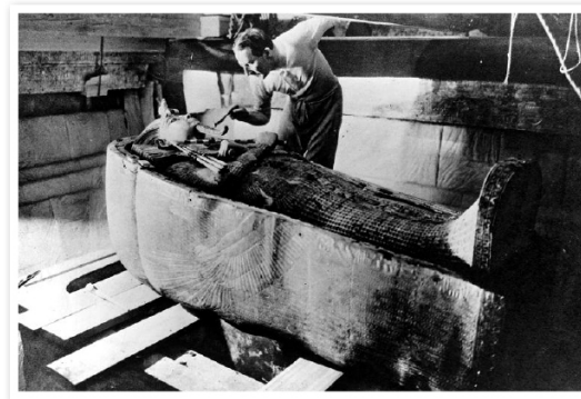
Howard Carter examining the tomb of Tutankhamun

A wealthy Englishman, Lord Carnarvon, was interested in ancient Egypt. He paid for an archaeologist called Howard Carter and a team of workers to carry out excavations in the Valley of the Kings on the west bank of the Nile, where they discovered Tutankhamun's tomb. It took Carter and his team 10 years to remove over 3000 items from the tomb. After the discovery, a series of strange events occurred, including the death of Lord Carnarvon. Many people believed a curse had been placed on Carter's team for disturbing the tomb.