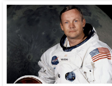
First person to step on the Moon (USA) Neil Armstrong July 1969