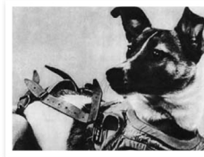
First animal in space (USSR) Laika the dog November 1957