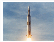
First manned spacecraft to orbit the Moon (USA) Apollo 8 December 1968