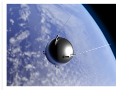
First satellite in space (USSR) Sputnik 1 October 1957

The Space Race was a competition between the Soviet Union (USSR) and the United States that took place in the 1950s and 1960s when the two countries were involved in a war called the Cold War. The main aim of the Space Race was to go into space and reach the Moon first. President of the United States, John F Kennedy, famously declared, 'We choose to go to the Moon!' By the end of the decade, both the USSR and the USA had invented the technology to make it possible. There were many exciting firsts during the Space Race.