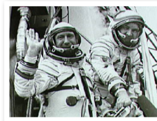
First spacewalk (USSR) Alexey Leonov March 1965