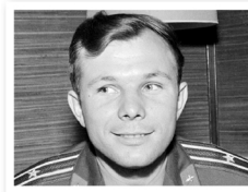
First human in space (USSR) Yuri Gagarin April 1961