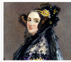
Ada Lovelace first computer programmer