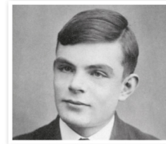
Alan Turing computer science pioneer