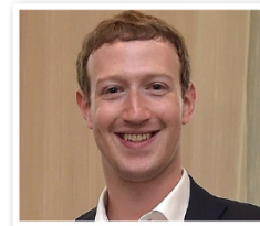
Mark Zuckerberg co-founder of the social-networking site Facebook