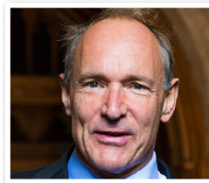
Sir Tim Berners-Lee creator of the World Wide Web, the system used to access the internet