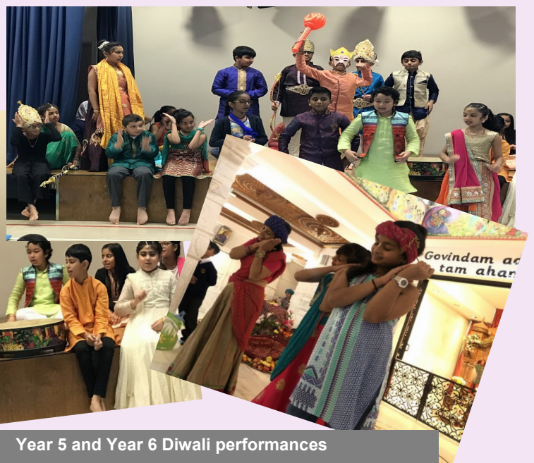
Year 5 and Year 6 Diwali performances