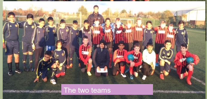
The two teams