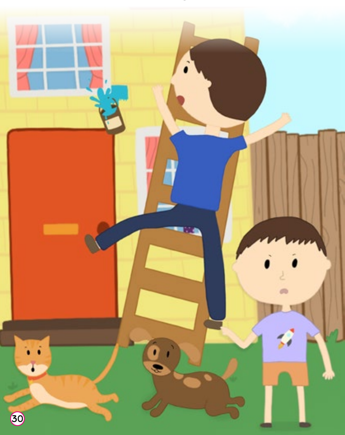
Sit, Sam the dog!